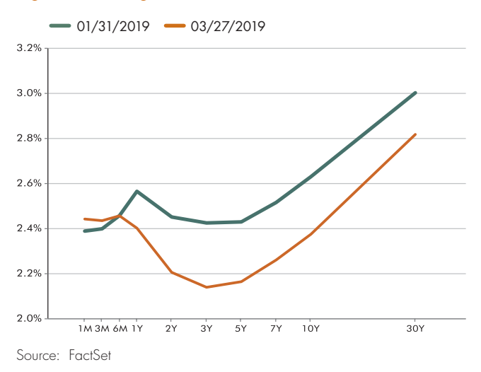
Figure 1 traces its evolution during the first quarter.

As we can see above, short term rates remained anchored to the Fed Funds rate and held steady just above 2.4% during the first quarter. Long term rates, however, fell in March after the unexpected Fed announcement. This inversion was caused by a decline in long rates on the heels of muted inflation, a dovish shift by the Fed and signs of a cooling economy.