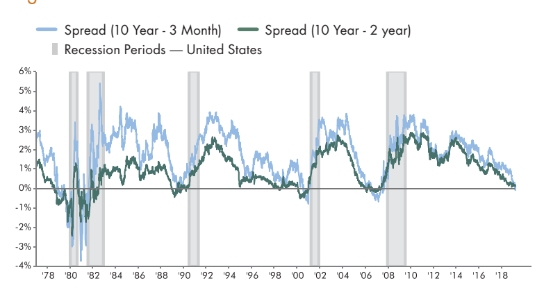
Figure 2: Recent Yield Curve Inversions

At a more nuanced level, historical inversions have typically been observed first with the 2-year rate and only later on with the 3-month rate. The Fed's intentions to tighten get priced in through a rise in the 2-year rate. The Fed's subsequent actions when they implement the signaled rate hikes eventually cause the 3-month rate to go higher. History reveals that the 10y-2y spread inverts before the 10y-3m spread. We have not seen this happen in the current inversion.